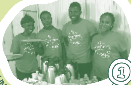
The LIME project in Spain

Labour Integration for Migrants Employment