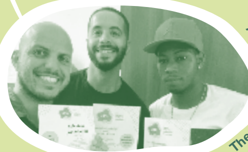
The LIME project in Italy